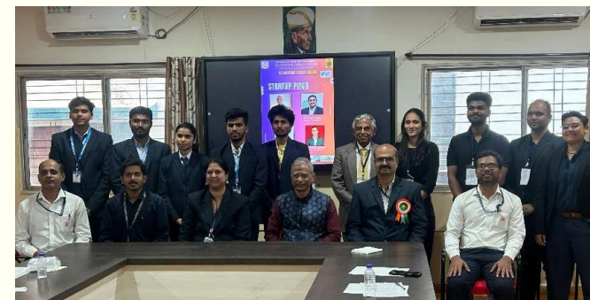
Startup Fest organized in Tech Manthan Dated 28/01/2025 and 20/01/2025