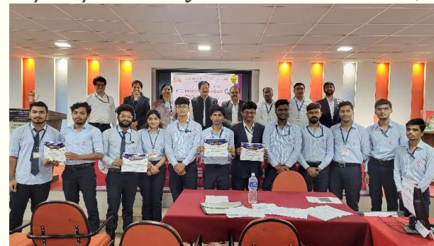
Project To Product competition for Final year students , Felicitation of Winners, 15/04/2024