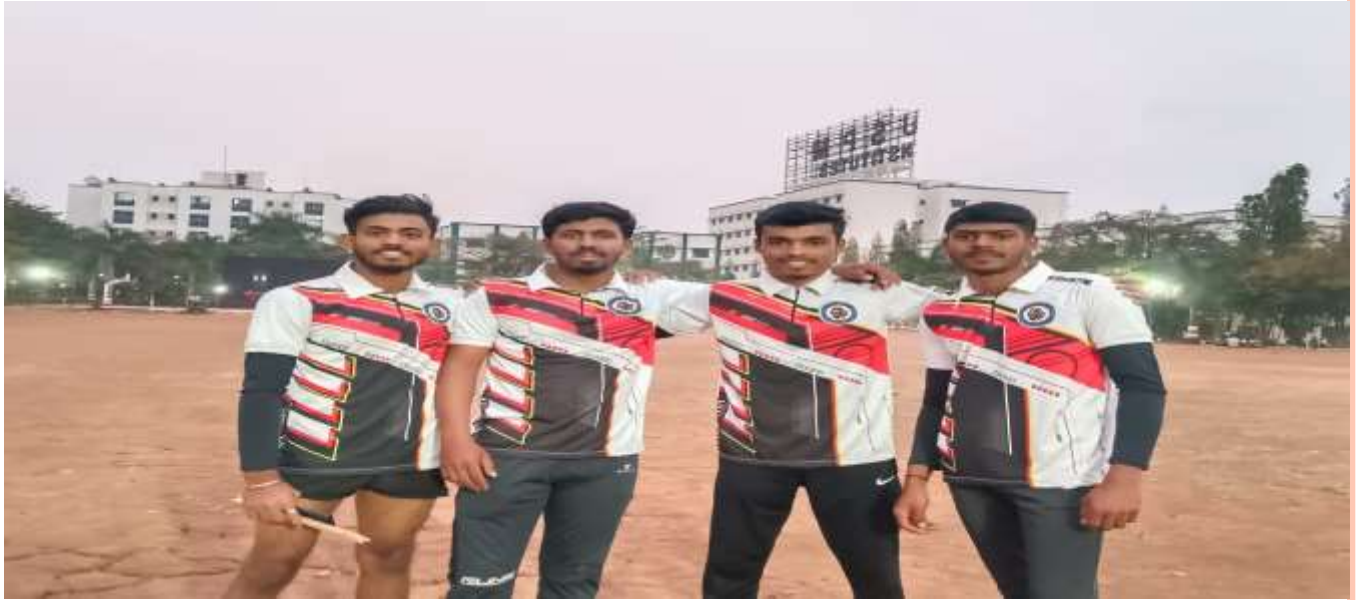
Relay 4x100 Meter Winner .