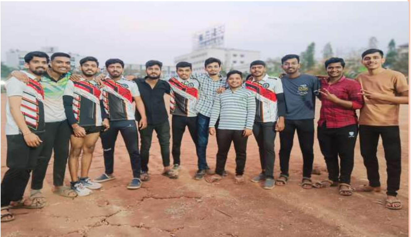
Kho-kho Runner Up